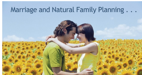
Marriage and Natural Family Planning . . .

Sunday, Sept. 1st 10:00 a.m. Polka Mass followed by games & food stand, Bean Bag Tournament, Quilt Auction, Music by the JMD3 band, and Grand Raffle at 7:00 p.m.