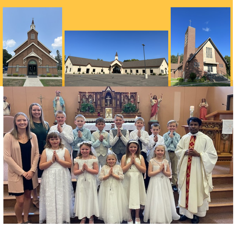
First Communion 2024

Contact the office before the desired date.