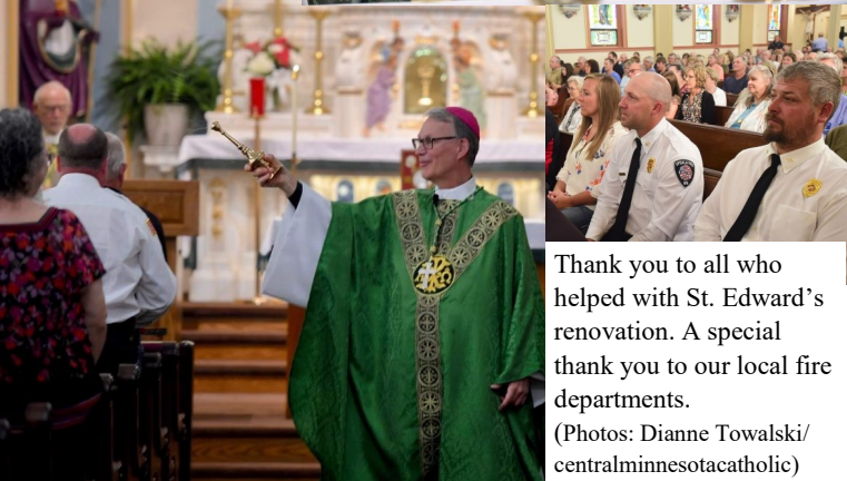
Thank you to all who helped with St. Edward's renovation. A special thank you to our local fire departments.

Fourteenth Sunday in Ordinary Time July 7, 2024